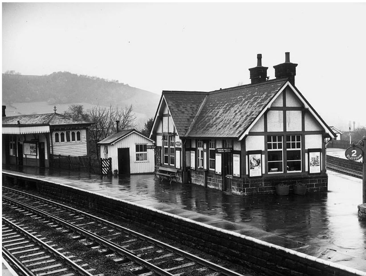
OP01402 AMBERGATE STATION, Ripley, Derbyshire, 1950-1969